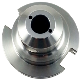
Examples of Jet-Blast for special applications:

We do the work @ PIONEER in Chicago, allowing us to alter any stock item. We add 2 coolant ports standard, special configurations available upon request and application. Delivery is 1-3 days.